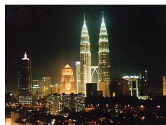
Petronas Twin Towers, Malaysia