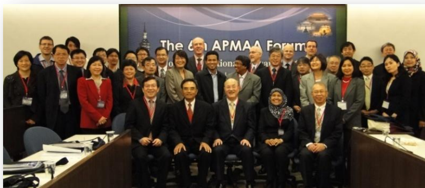
Presenters at the APMAA 6 th Forum, 5 th November, 2010