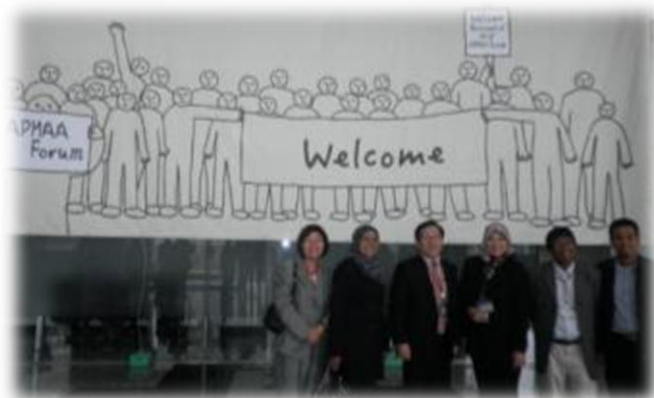
The Malaysian Team waiting to welcome you at the 7 th Conference.