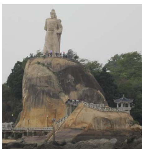
Figure 2 Statue in Xiamen Harbor

On the second day of the conference, there were 16 concurrent sessions held. In total there were 47 papers presented in four different categories. Discussions between the presenter and the audience, and comments from participants proved to be active and valuable.